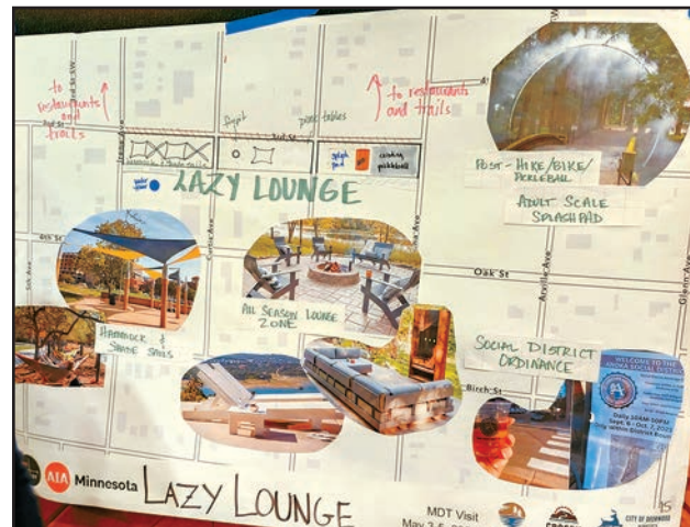
THE MINNESOTA DESIGN Team suggests a Lazy Lounge be constructed on the green space across the street from the Ironton City Hall on the old railroad grade.