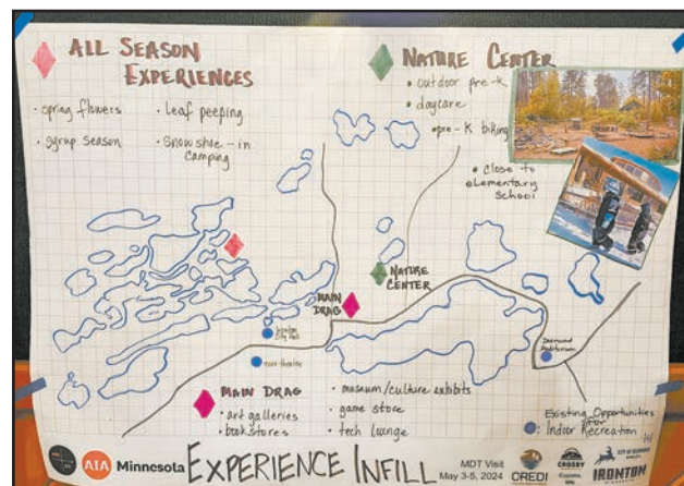
THE MINNESOTA DESIGN Team's illustration of examples of infill which could include a Nature Center near Cuyuna Range Elementary School with a daycare center.