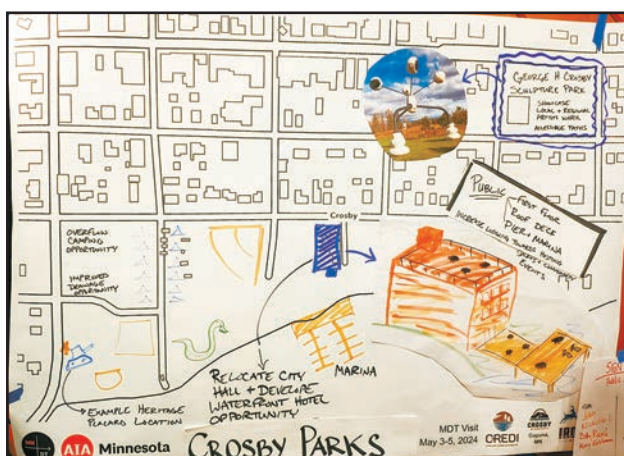
SUGGESTIONS FOR CROSBY'S parks from the Minnesota Design Team include adding sculptures in the George H. Crosby Memorial Park on Main Street and replacing the Crosby City Hall and police stations with a building with retail space on the ground floor, a hotel on the upper stories and a roof top deck overlooking Serpent Lake.