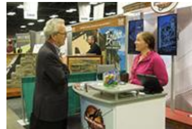
Exhibit Hall booth reservations & sponsorship opportunities now available. 2016 exhibitors will have first right to renew booth from last year. Reserve your booth & view sponsorship information »

New for exhibitors this year, lead retrieval and opportunities for 15-minute education programs at your booths. Learn more »